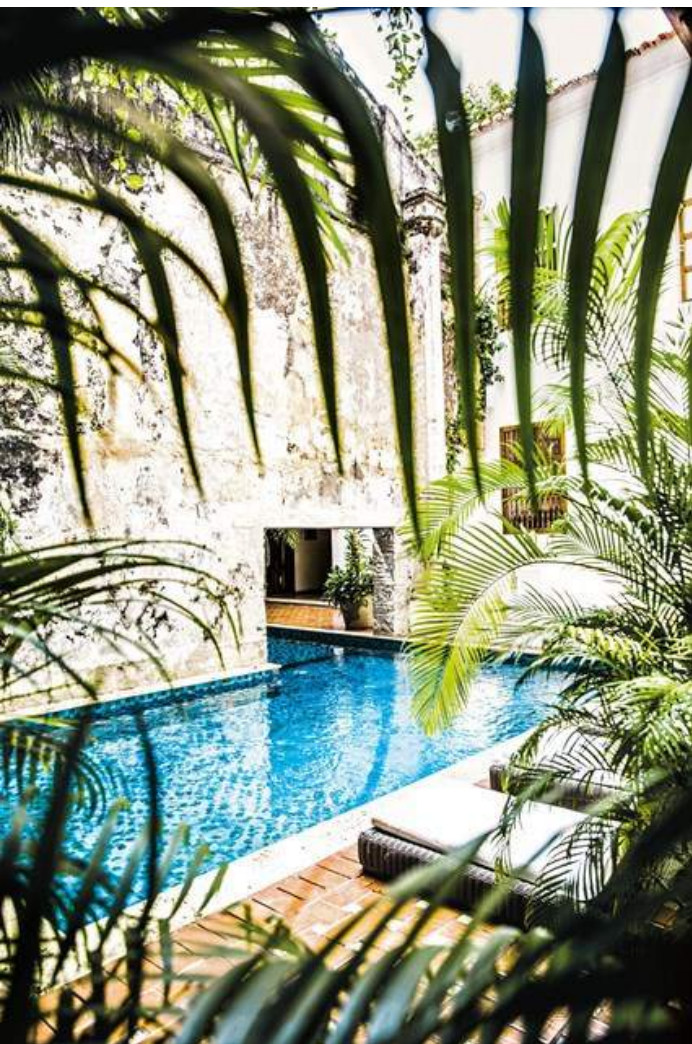
The pool at Casa San Agustin