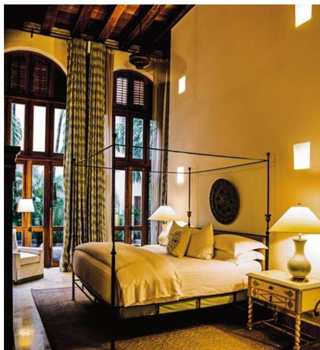
A bedroom at Casa San Agustin

The top boutique hotel in the old walled city, this is also one of the newest (it opened in 2012). Three 18th-century houses have been knocked through to form one glorious space. It's worthy of its five-star rating: nothing is over-looked here, and the staff are tremendous. An L-shaped pool in the courtyard flows beneath the city's former aqueduct. Upstairs is a library with deep armchairs and an honesty bar. Rooms are big with iPads, canopied beds and marble-tiled bathrooms. The street-level Alma restaurant is excellent: eat while watching the horse-drawn carriages rattling past.