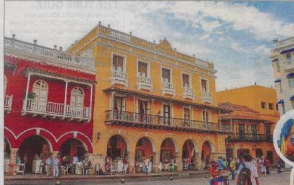
Vivid: Plaza del Reloj in Cartagena. Traditional paienqueas, below, wildlife and markets are big draws

Thanks to influences from Spain, Africa and the Middle East, the restaurant scene is just as varied. Ceviche is a star dish — fresh, diced fish or seafood flavoured with red onion, coriander and, often, coconut milk. Find