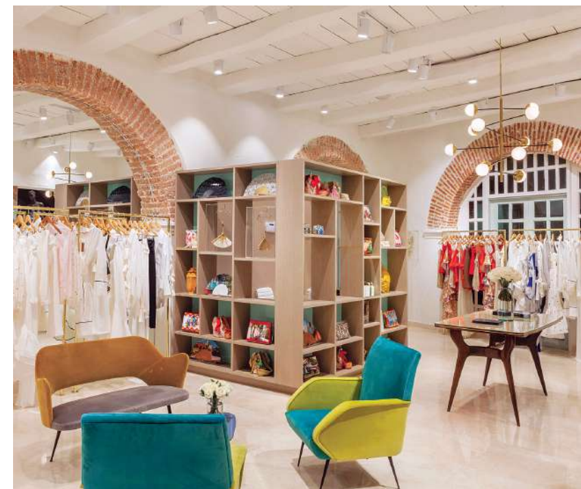
CLOCKWISE FROM TOP: Shopping in Cartagena de Indias; Centro Histórico; the bar at the San Pedro Café/Mirador Restaurante.

As one of the oldest colonial cities in Latin America, Cartagena has no shortage of sights to see. The dominant feature of the Old City is the Castillo de Don Felipe de Barajas, whose fortifications are among the oldest in the Americas. The Palace of the Inquisition shines a delightfully macabre light on one of the darker chapters in Spanish colonial history, while the Gold Museum highlights the spectacular metalwork of the indigenous Zenú people. The newly chic neighborhood of Getsemani features endless boutiques and cafés, and an afternoon of shopping for local crafts at Las Bóvedas is a haggler's dream. But ultimately, the charm of Cartagena lies in simply walking the streets and happening upon a sculpture by Fernando Botero or an arresting piece of graffiti, turning a corner