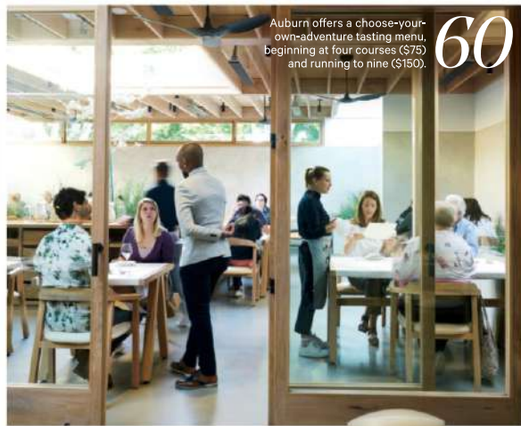
Auburn offers a choose-your-own-adventure tasting menu, beginning at four courses ($75) and running to nine ($150).