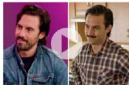
THIS WEEK ON THR VIDEO Milo Ventimiglia drops by In Studio to talk all things This Is Us .

62 Headaches, Throwing Up and 'Mysticism' in Machu Picchu Blair Underwood shares highlights and lowlights of