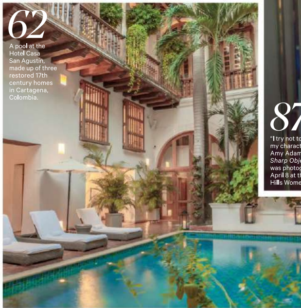
62 A pool at the Hotel Casa San Agustín, made up of three restored 17th-century homes in Cartagena, Colombia.