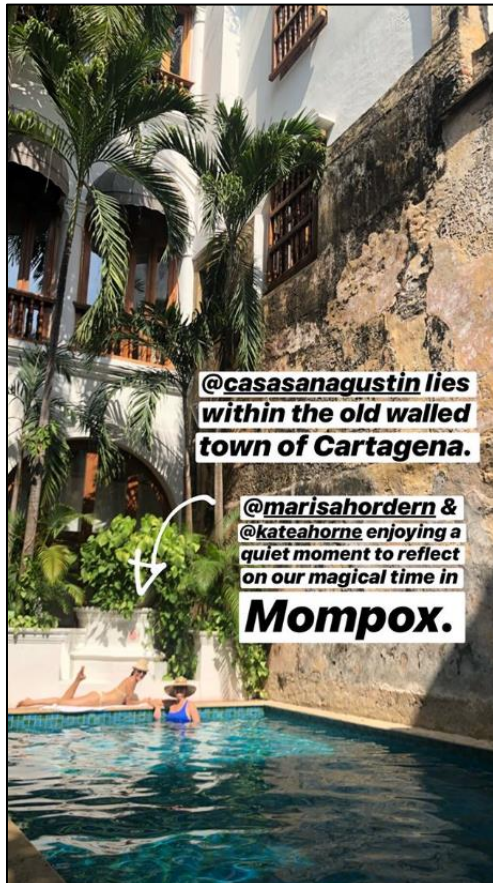
@casasanagustin lies within the old walled town of Cartagena.