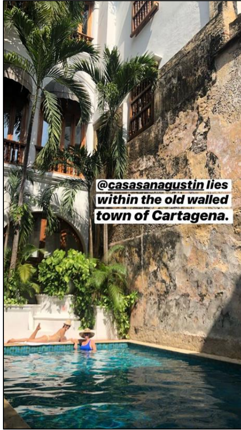
@casasanagustin lies within the old walled town of Cartagena.