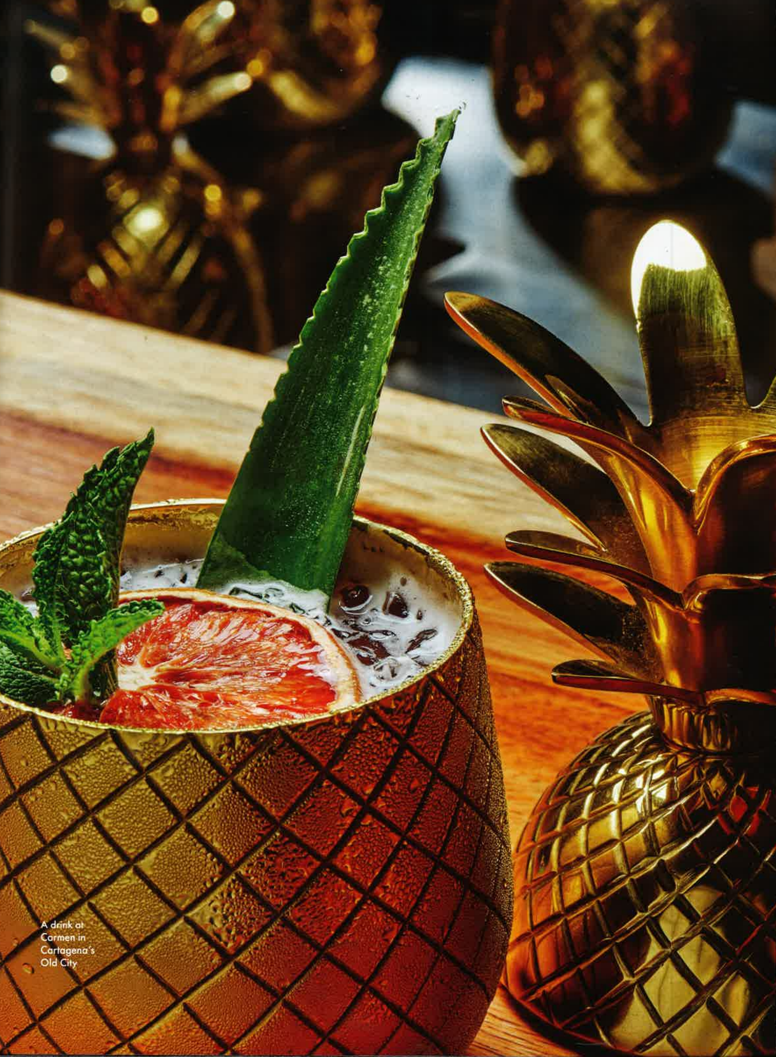
A drink at Carmen in Cartagena's Old City