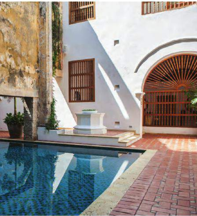
Clockwise from left: Casa San Agustin; Casa Medina;