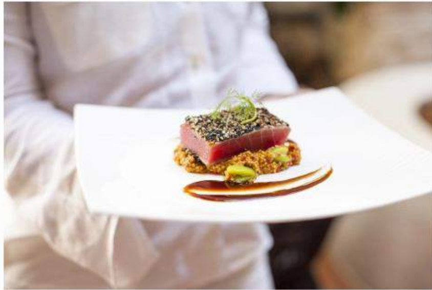
Seared Ahi Tuna