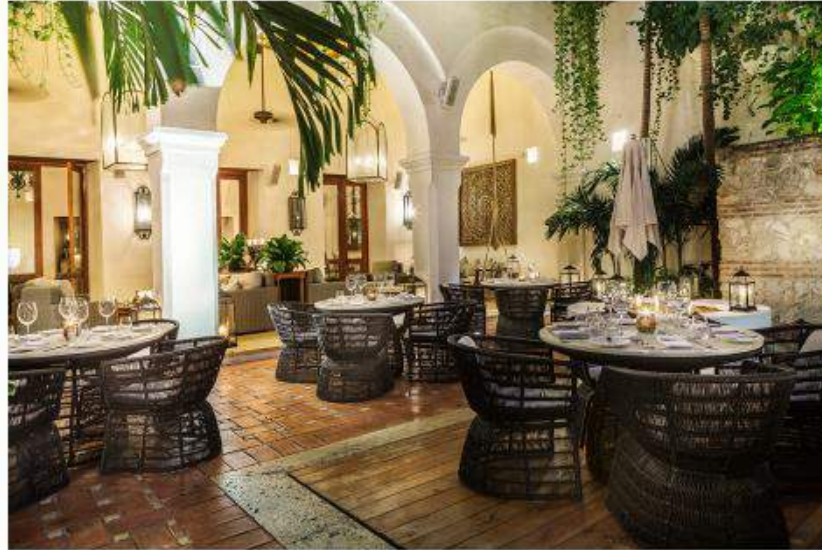
Dining Room, Alma Restaurant