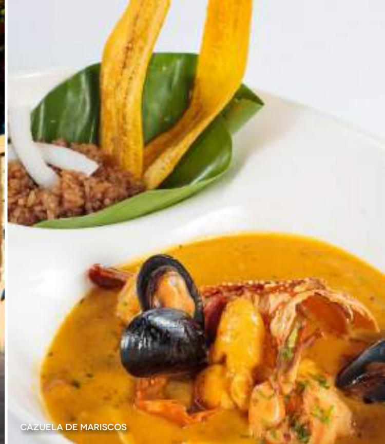
CAZUELA DE MARISCOS