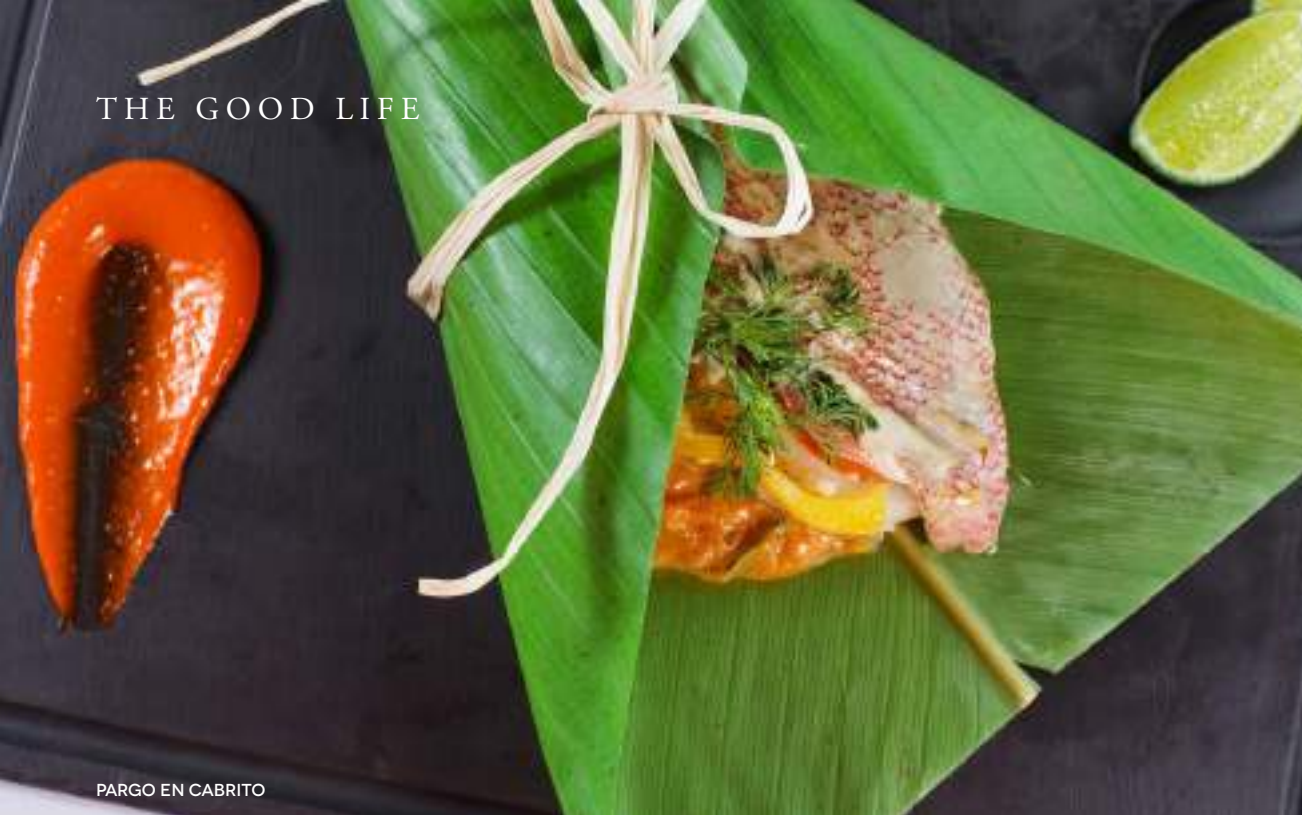
PARGO EN CABRITO