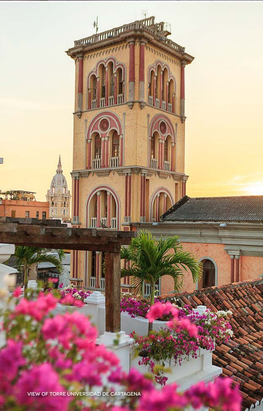
VIEW OF TORRE UNIVERSIDAD DE CARTAGENA