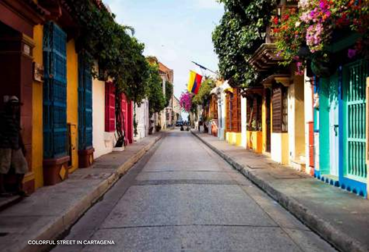
COLORFUL STREET IN CARTAGENA