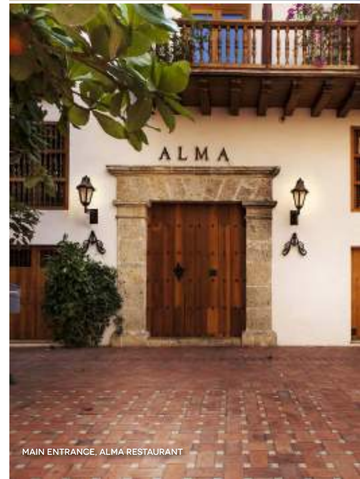
MAIN ENTRANCE, ALMA RESTAURANT