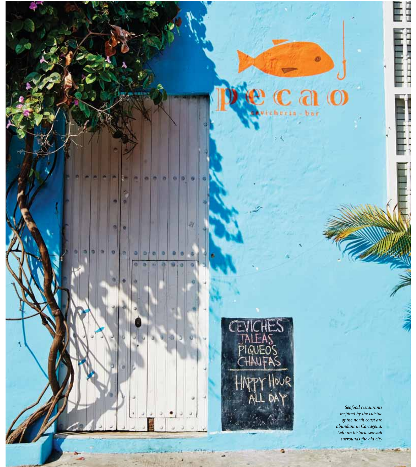
Seafood restaurants inspired by the cuisine of the north coast are abundant in Cartagena. Left: an historic seawall surrounds the old city